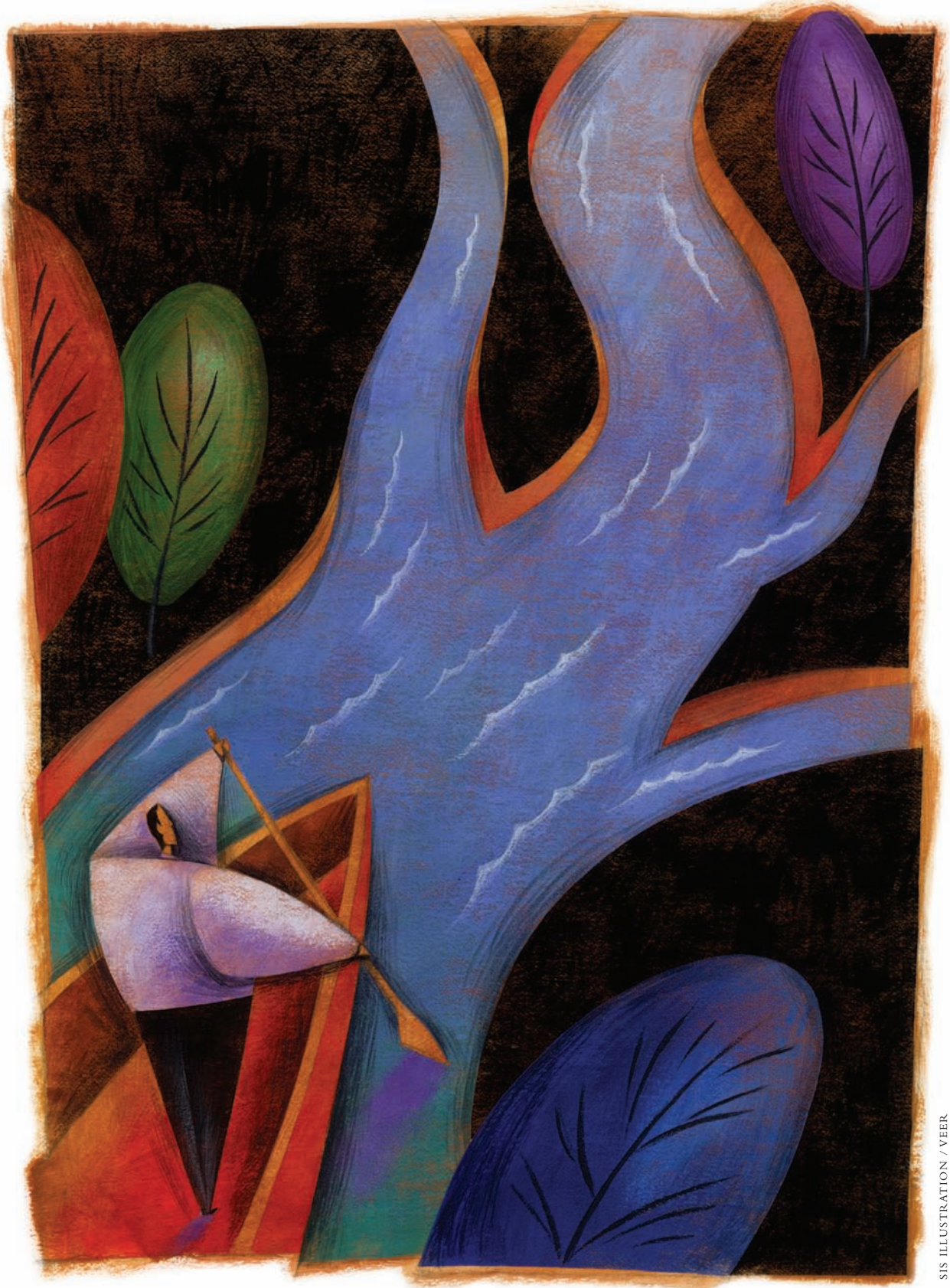
SIS ILLUSTRATION / VEER